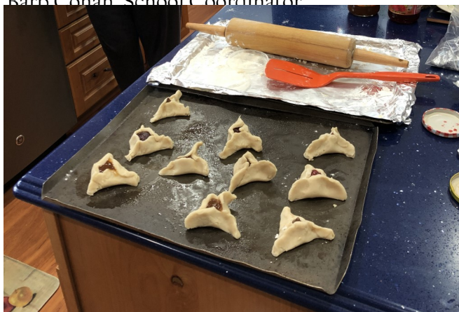
Hanukkah Fun with our students!