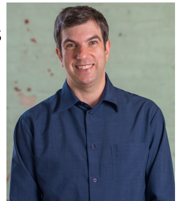
New York Times bestselling Author and Journalist AJ Jacobs